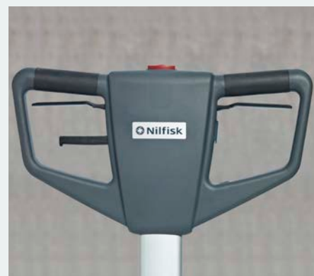
Ergonomic handle, with smooth round edges, easier operation and less fatigue