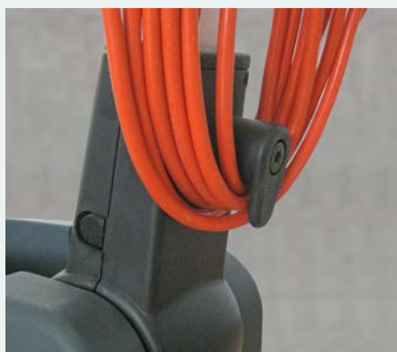
Cable hook for greater comfort