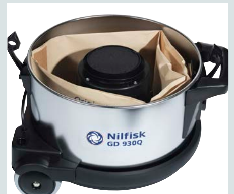
Durable steel container and 15 litre dust bag