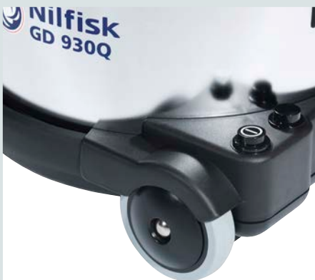
Dual speed function