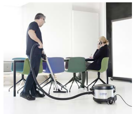
The GD 930 is the perfect choice for demanding applications such as offices, hotels and public buildings