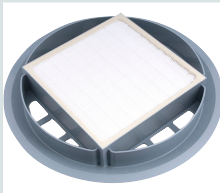
HEPA H13 filter capable of capturing 99.997% of particles down to 0.3 microns