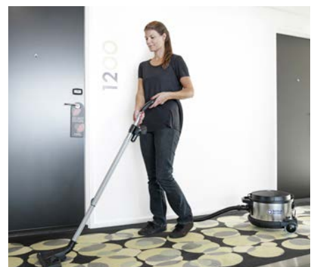
The new GD 930Q is specially built for noise sensitive areas with a low comforting background sound pressure level of only 42 dB(A)