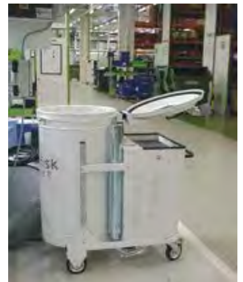
Power and capacity in a trim-extractor.