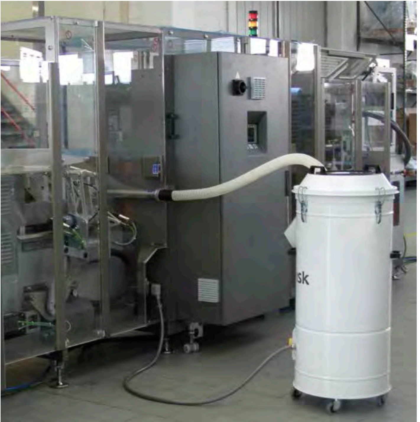
R model on a packaging machine.