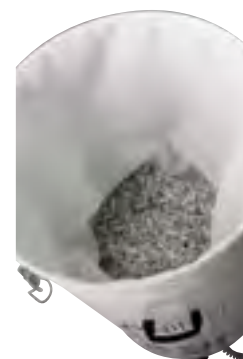
Trims inside the container