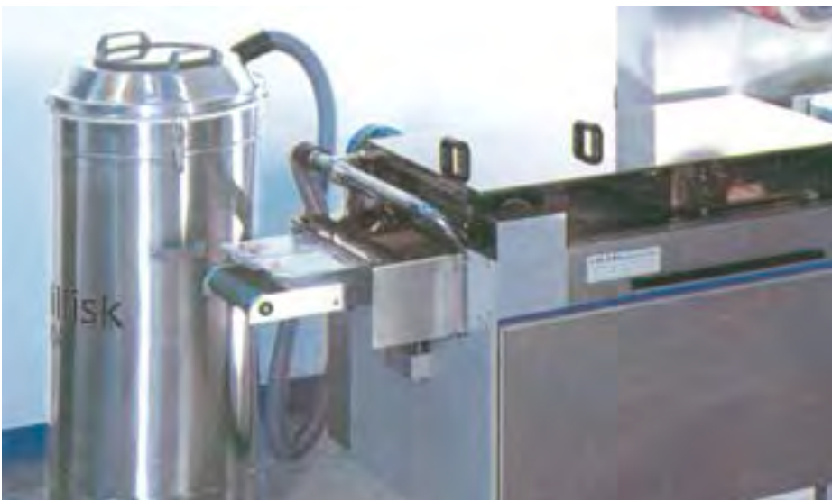
Collection of trims from packaging machine.