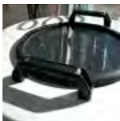
Window to control the trims level