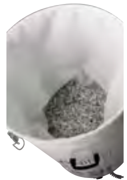
Trims inside the container