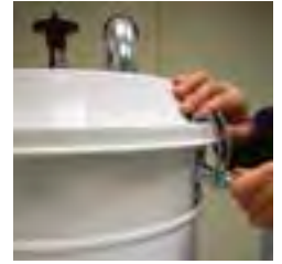
Easy maintenance/replacement of the filter