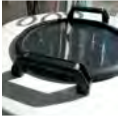
Window to control the trims level