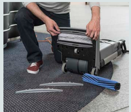
Apart from getting faster cleaning of hard floors, you will also be able to freshen up smaller carpets, including removal of spots, by adding an optional carpet kit. Brush and squeegees can be removed without any tool making daily maintenance operations easy and fast