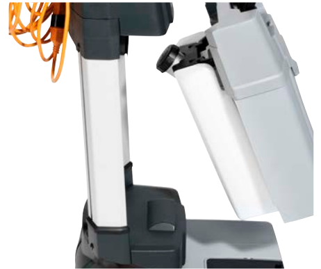
Each tank can be removed quickly and carried in one hand.