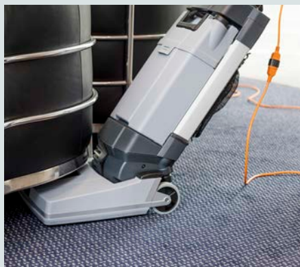
The SC100 clean in a position height of just 25 cm