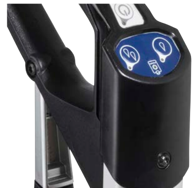
You will remain in full control of the scrubber dryer thanks to the intuitive touch display with two water settings and a solution indicator, alerting you if the tank is empty