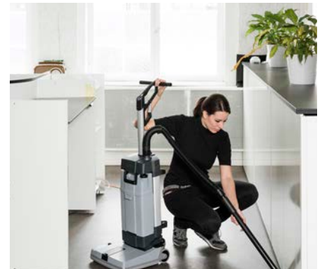
The optional manual suction hose is ideal for cleaning any unreachable area or spot cleaning.