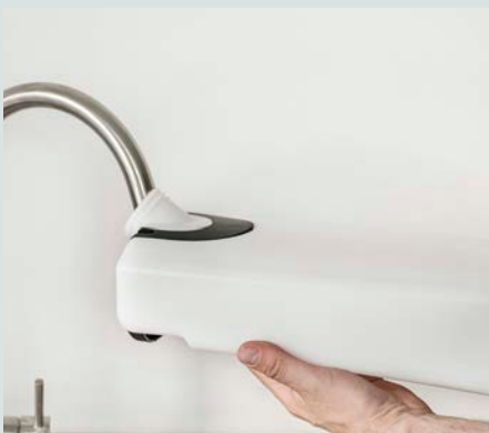
Easy to fill the solution tank with water in any low sink