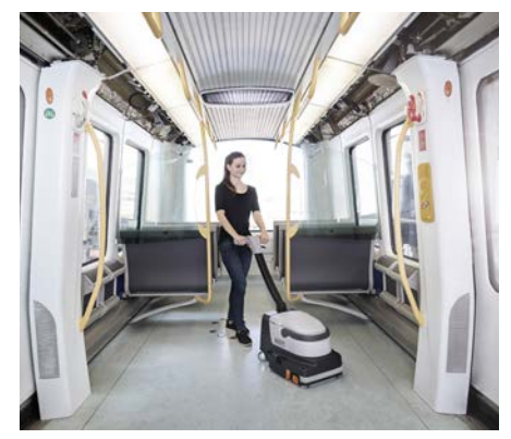
Easy to maneuver thanks to its pivoting wheels and the ergonomic adjustable handle