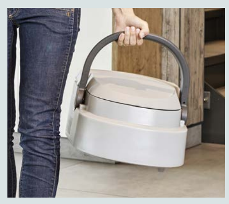
Tank-in-tank design for easy handling when emptying and refilling