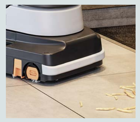
Easy pick-up of larger debris as front squeegee can be lifted