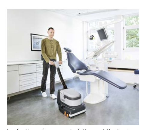
In-depth performance to fully meet the hygiene standards of clinics and hospitals