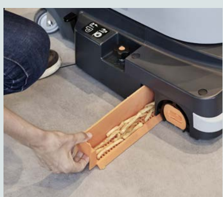
Easy access to emptying and cleaning the debris tray