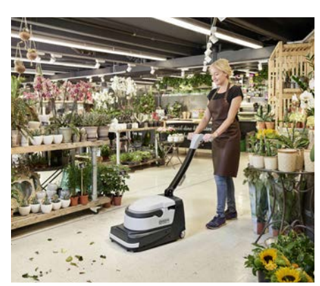
Cleaning floors with ease and speed - sweep, scrub and dry at the same time