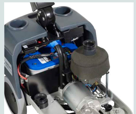
The powerful brush motor is designed for maximum reliability and cleaning performance