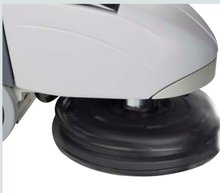
The unique rotating deck and 27 kg brush pressure enable SC351 to clean and dry both forward and backward reaching even the most inaccessible places