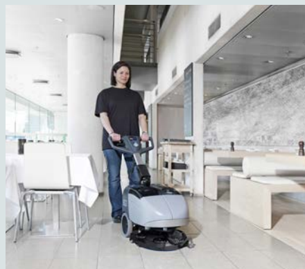
Low sound level allow daytime cleaning in sound sensitive areas