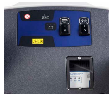
As easy as can be: You can effortlessly operate the SC450 by two buttons and a switch only