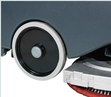
Adjustable machine deck and 34 kg down pressure for heavy-duty tasks offer you the best opportunities for all round cleaning