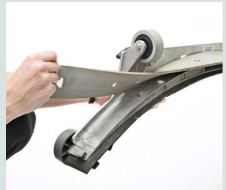
You are able to use the squeegee blades on both sides thus saving costs. And changing is easy. You don't need any tools