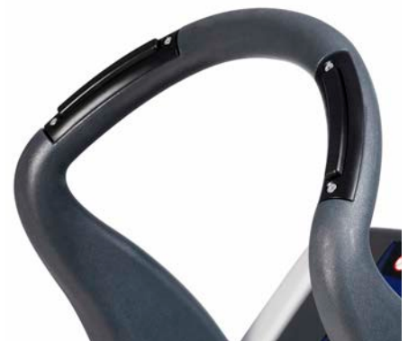
You have a safety switch practically placed on the handle for your convenience