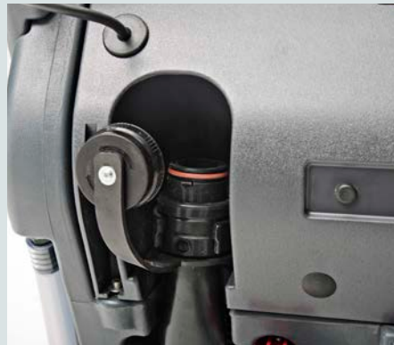
You get drain hose with soft, squeezable section enabling manual flow control, and curved squeegees for better performance and drier floors