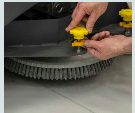
Serviceability: New maintenance free motor, high-quality gearbox and added yellow touch points