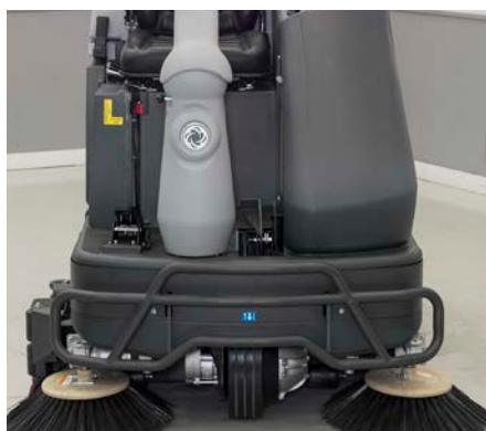
Dual side brooms (cylindrical models) deliver true edge cleaning

The exceptional Ecoflex system allows the operator to match the floor cleaning machine's performance to the soil on the floor and the required level of clean. When encountering more soiled areas of the floor, the operator can activate the "burst of power" button for extra cleaning performance, and as easily return to original settings for minimum usage of water, detergent and power. Green meets clean.