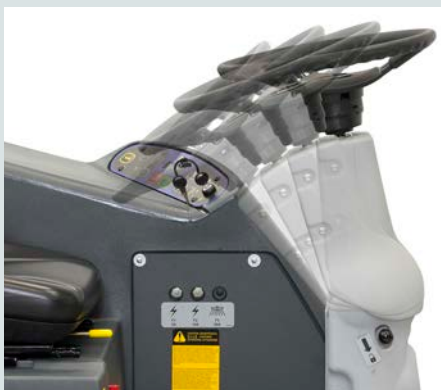
Tilt steering wheel for easy boarding, plus ergonomically designed operator compartment for safety and comfort