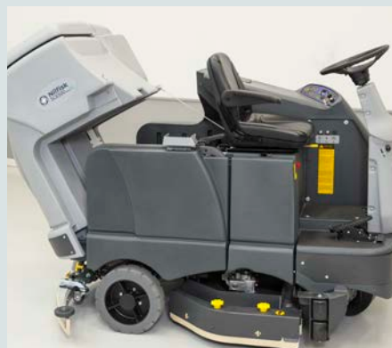
Tip-out and lift-off recovery tank