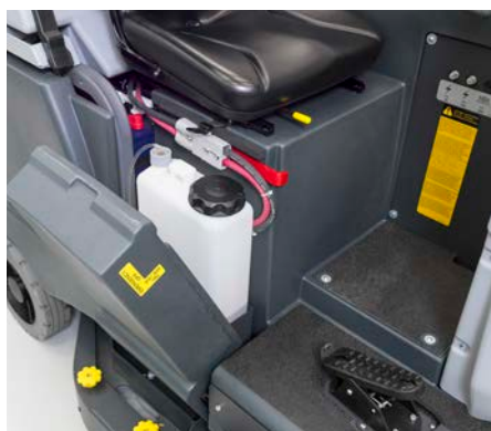
Ecoflex chemical kit (optional): easy accessible detergent cartridges