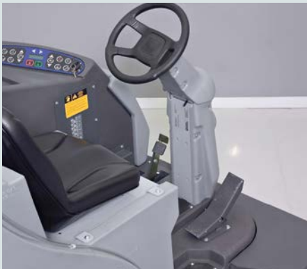
The new Kubota engine improves user comfort through reduced vibration.