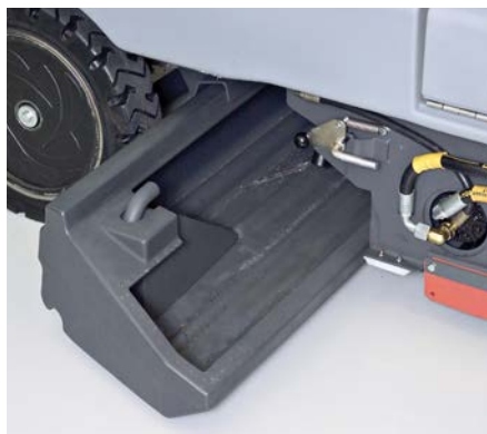
Productivity is increased with the 42 litre vacuumed hopper which is easy to slide out.

The exceptional Ecoflex system allows the operator to match the floor cleaning machine's performance to the soil on the floor and the required level of clean. When encountering more soiled areas of the floor, the operator can activate the “burst of power” button for extra cleaning performance, and as easily return to original settings for minimum usage of water, detergent and power. Green meets clean.