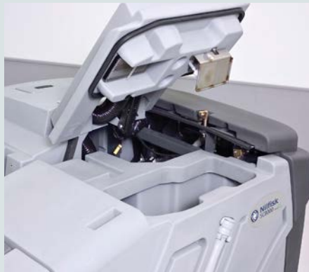
Cleaning of the machine is easy thanks to the tip out recovery tank opening with debris tray.