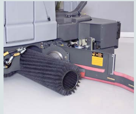
Maintenance is quick because replacement and adjustment of squeegee blades, side blades, and brushes require no tools.