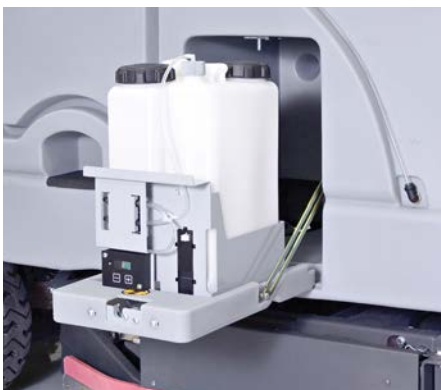
The on-board Ecoflex concept system provides productivity and savings through accurate dispensing