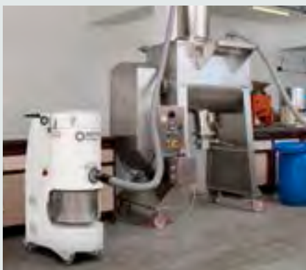
Daily cleaning of driers