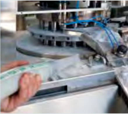
Cleaning of a processing machine