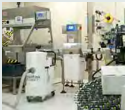
Recovery of waste from a packaging machine