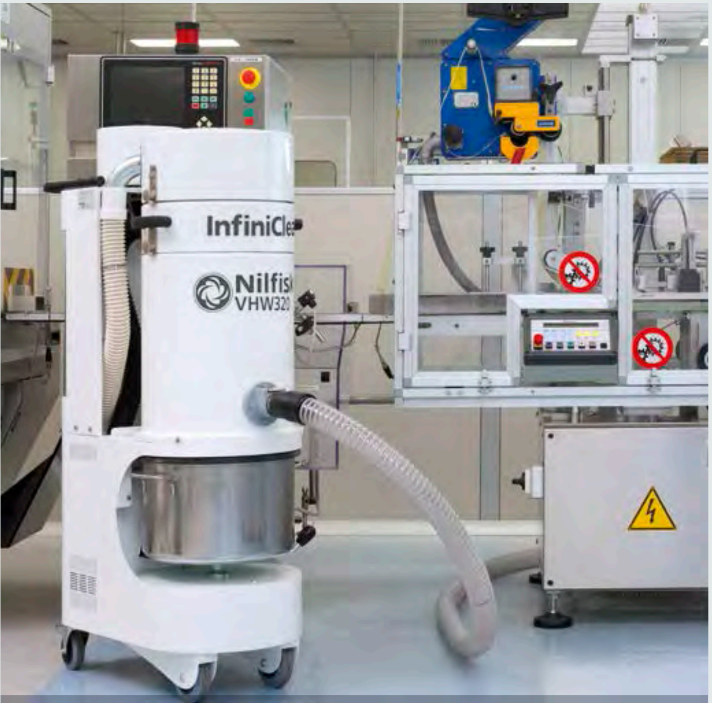
VHW320 with infiniClean, the innovative automatic and stand-alone cartridge filter cleaning system