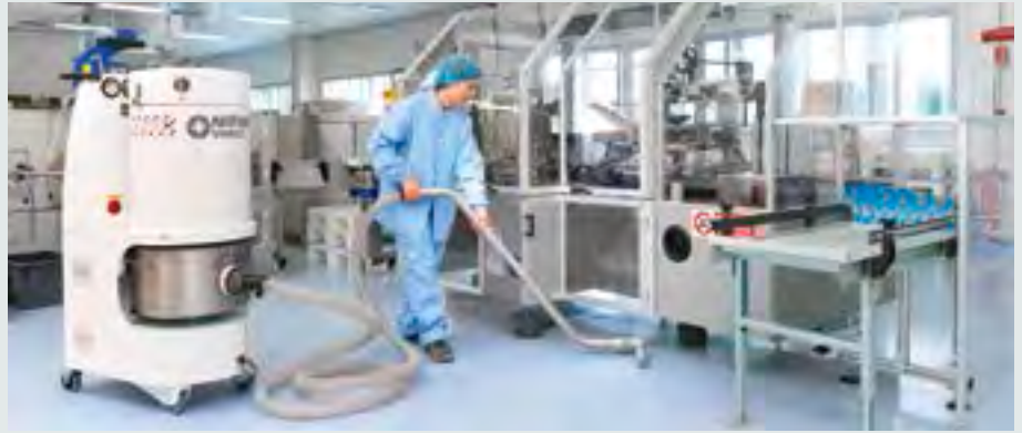
General cleaning of the lab