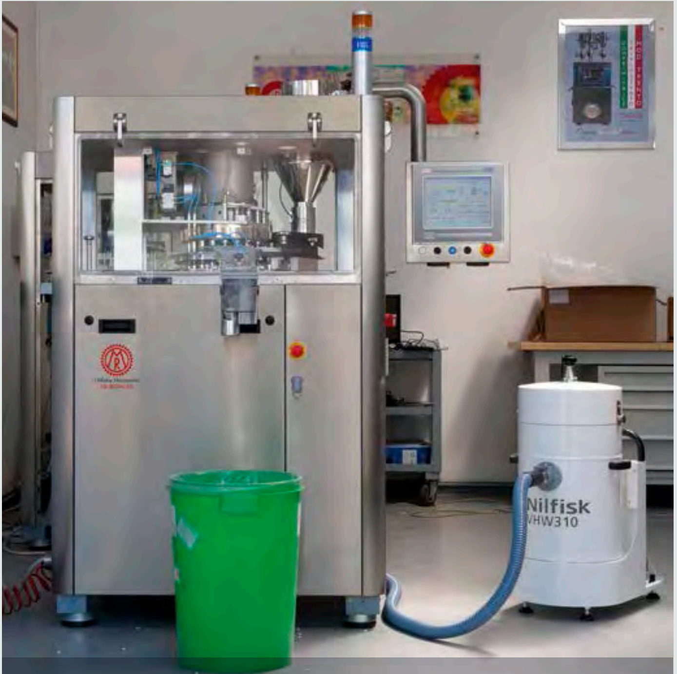
Fixed vacuum on tablet press machine.