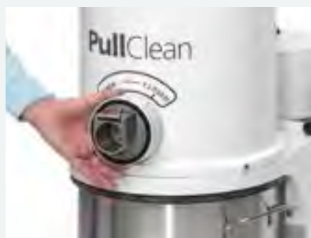
PullClean filter cleaning system