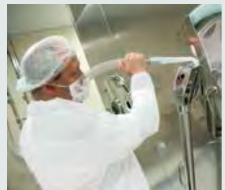
Cleaning of a coating pan