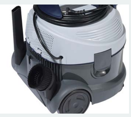
Ergonomic and easy to reach accessory parking

VP100 is fully compatible with the range of accessories offered with the rest of the Nilfisk dry canister vac portfolio. It allows to be more flexible in replacement of accessories and reduce the overall operating costs of your complete Nilfisk cleaning solution.